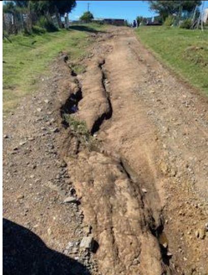
Avenue D (125m)