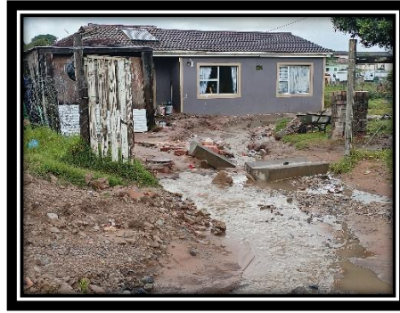
Wentzel Park Ward 2