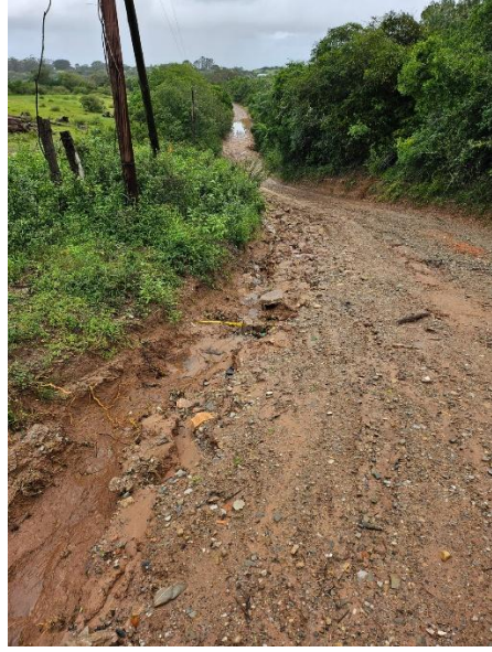
Murray Street in Bathurst (360m)