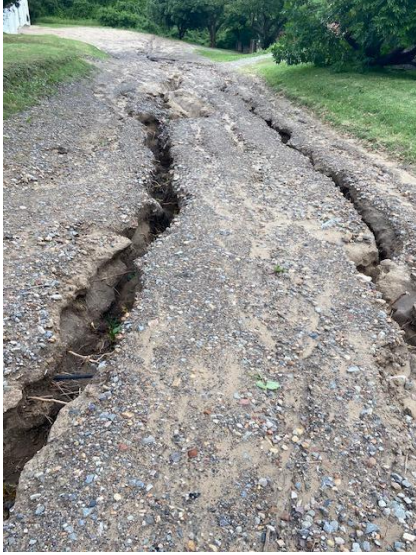
Strand Street (180m)