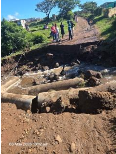
New Rest Road & Bridge (575m)