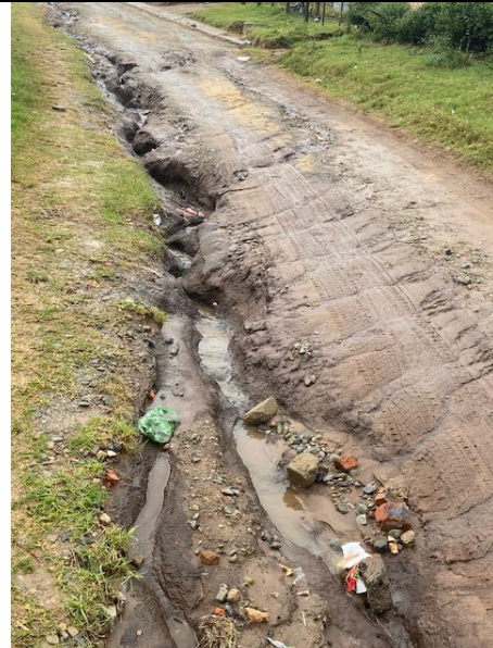
Jonas Street in Bathurst (630m)