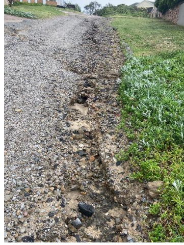
Carnoustie Avenue (210m)