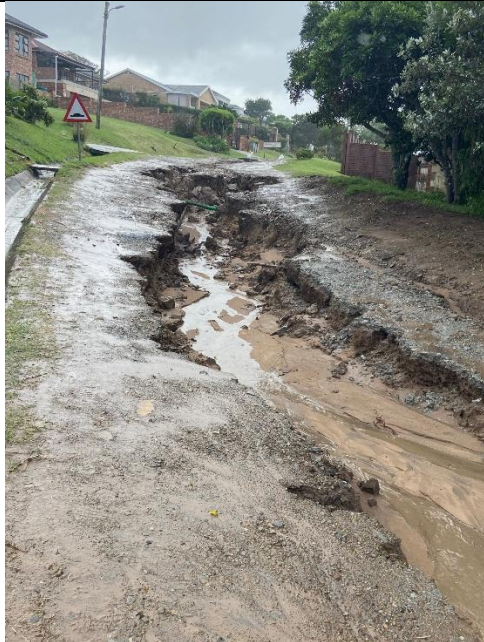
Findon Street (225m)