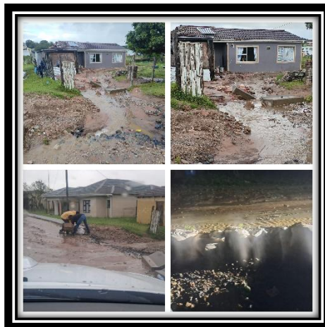
Localised Flood intervention