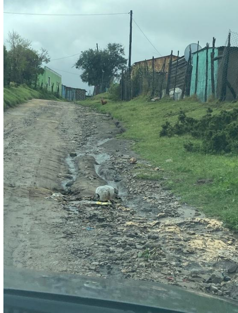
Nobebe Street in Bathurst (1115m)