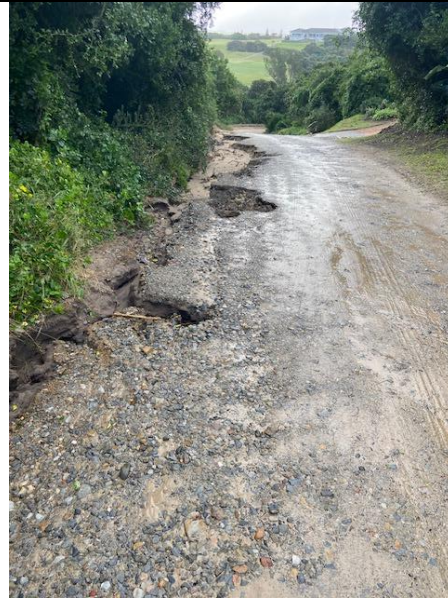
Muirfield Street (445m)