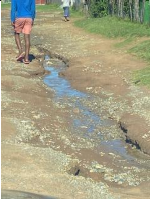
Ferguson Street (345m)