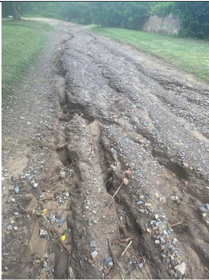
Ayelsbury Road (290m)

A handwritten signature in black ink, consisting of several loops and a long horizontal stroke.