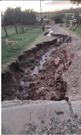
Rhanisi Street (135m)