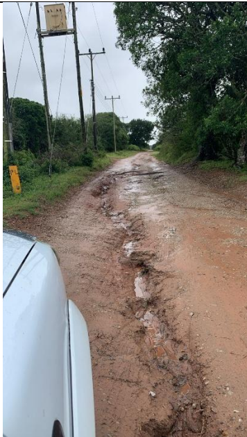
Gillanders Street (1170m)