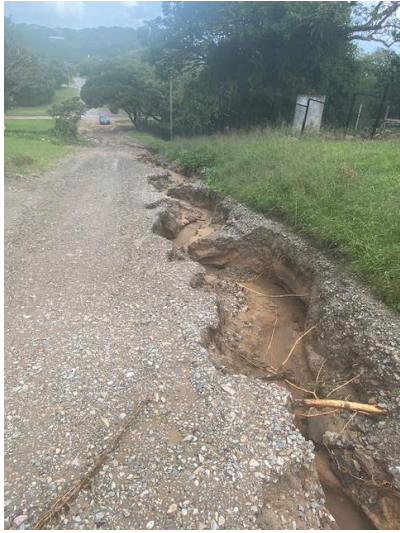
Vroom Road (285m)