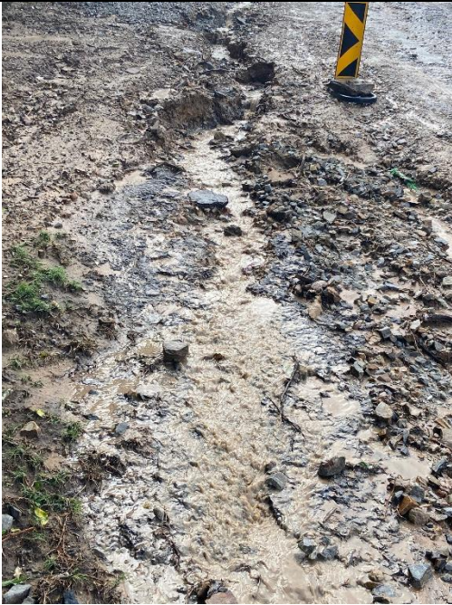
Horndean Street (220m)