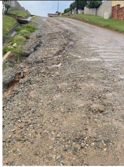
Seaford Street (470m)