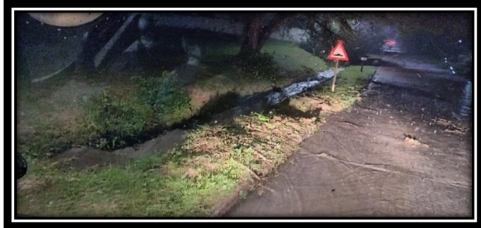
Storm water drainage clearing