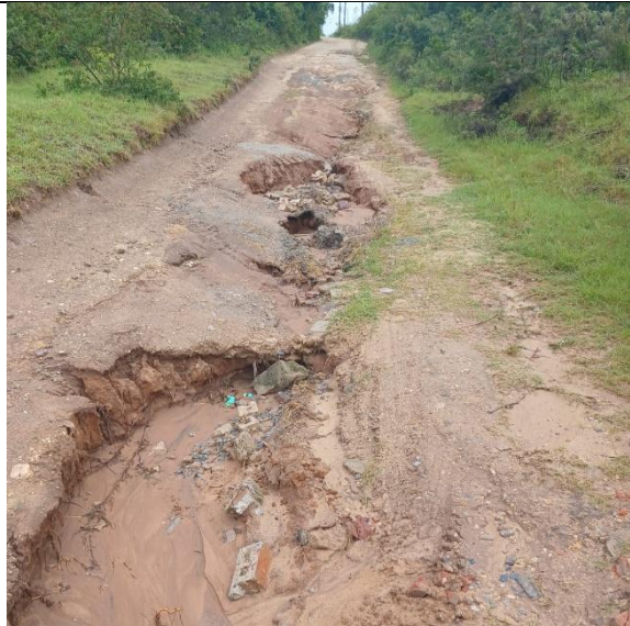
Timms Lane in Bathurst (390m)