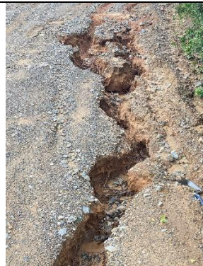
Prospect Lane (180m)