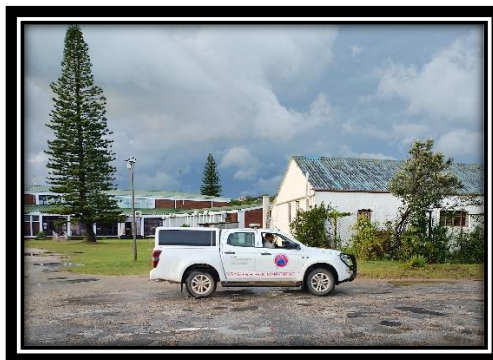
SBDM Disaster Management Coordinator (Ndlambe)