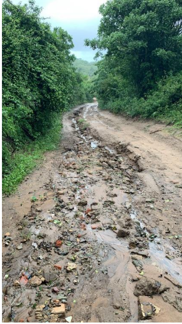
Mills Street in Bathurst (385m)