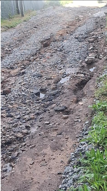
Caxton Street (330m)