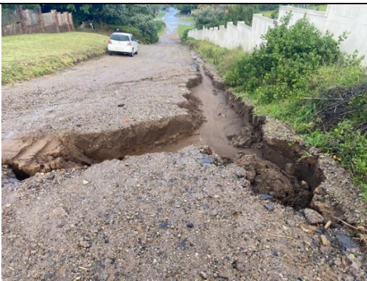
St Andrews Road (210m)