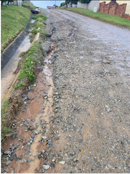
Sevenoaks Street (465m)