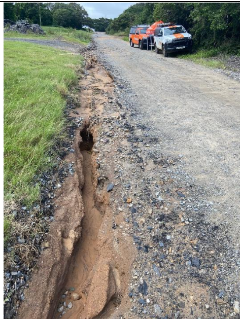
High Street (830m)