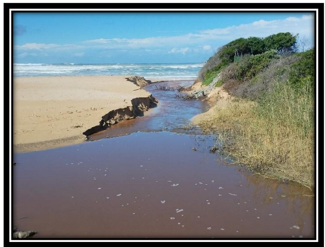
Breaching of rivers, estuaries and localised dams filling