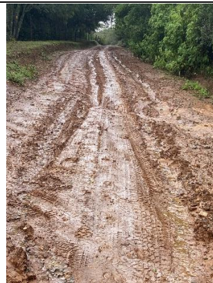
Bird Street in Bathurst (225m)