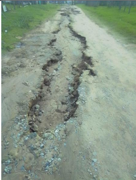
Thembisa Street in Bathurst (330m)