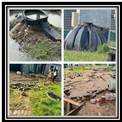
Septic tanks compromised (Ward 1)